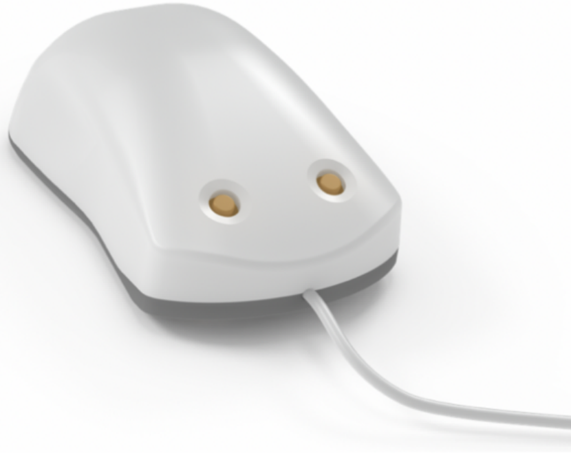
Figure 1. Two-point vibrotactile simulator (Brain Gauge Home; The Brain Gauge; Cortical Metrics, Chapel Hill, NC)